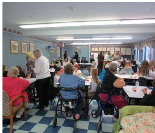
The Rosarians & the Jr. Rosarians made Valentine Day cupcakes for the seniors