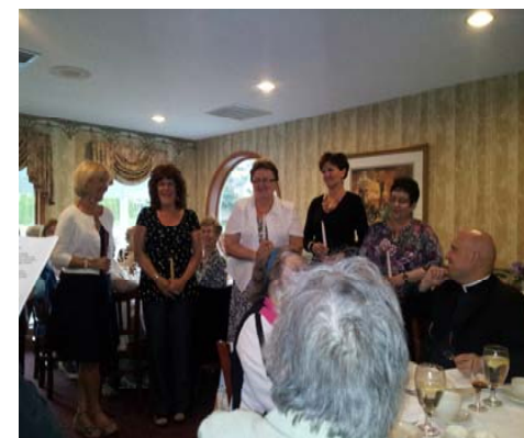
Installation of Officers for 2013-2014